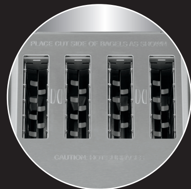
Wide toasting slots