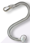
#GS1025 (11.25 in, adhesive disk)