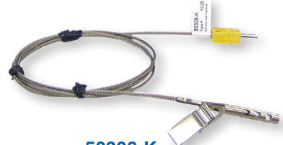
50306-K Oven / Freezer Probe