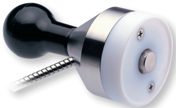
50014-K Weighted Griddle Surface Probe