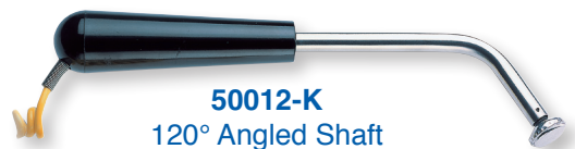
50012-K 120° Angled Shaft Surface Bell Probe