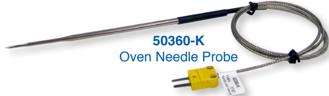
50360-K Oven Needle Probe