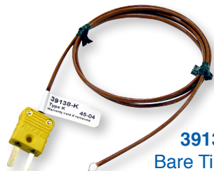
39138-K Bare Tip Probe