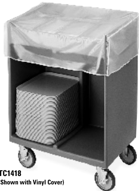
TC1418 (Shown with Vinyl Cover)