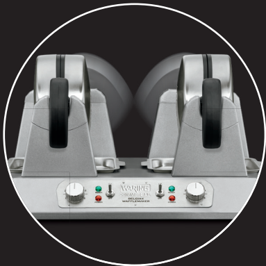
Rotary Feature For Even Baking And Browning