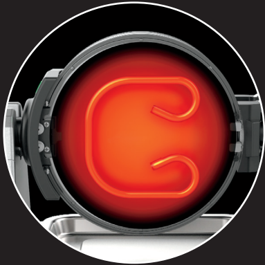
Embedded Heating Element For Precise Temperature Control