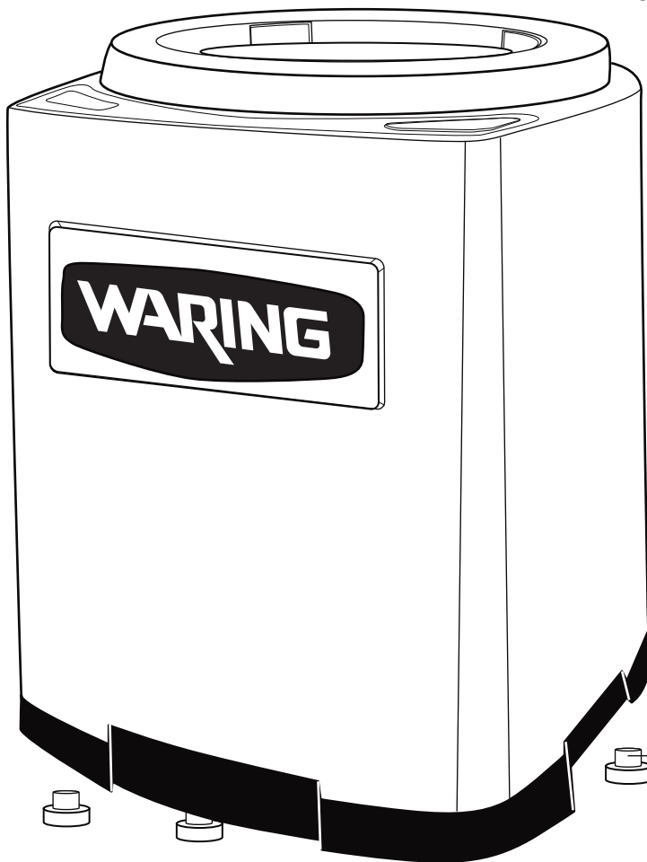
035136 Foot (4 required)