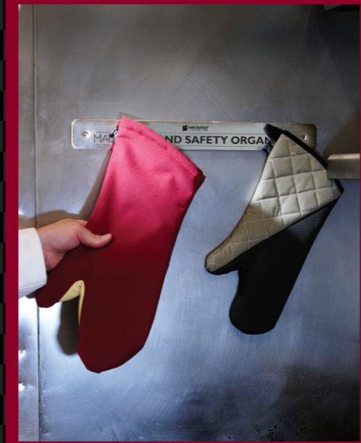
Use the magnet or additional loop for easy storage.