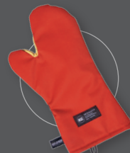
Cool Touch™ Oven Mitt