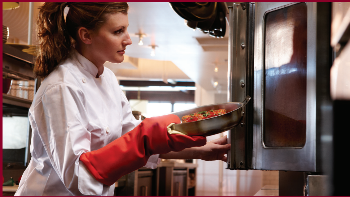
Cool Touch™ oven mitts are cost effective, easy to care for and PI49 Class I NSF certified. Made in the U.S.A.