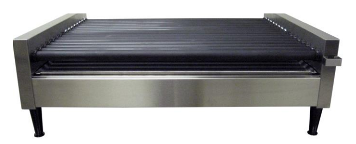
Roller Grill with control cover