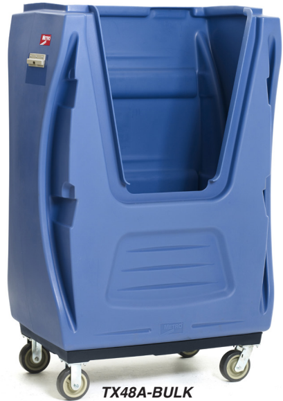
TX48A-BULK Bulk truck, with no enclosures

All Metro Catalog Sheets are available on our website: www.metro.com