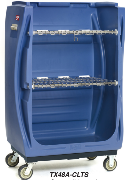
TX48A-CLTS Convertible truck