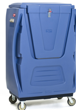
TX48A-BULKSEC Bulk truck, with enclosures

Gate and Lid: (option for bulk truck) Molded polymer construction with stainless steel hinges, latch and hardware. Color: Medium Blue