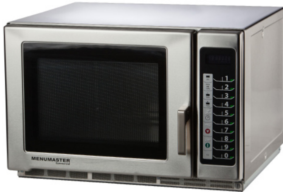
Model MFS12TS shown