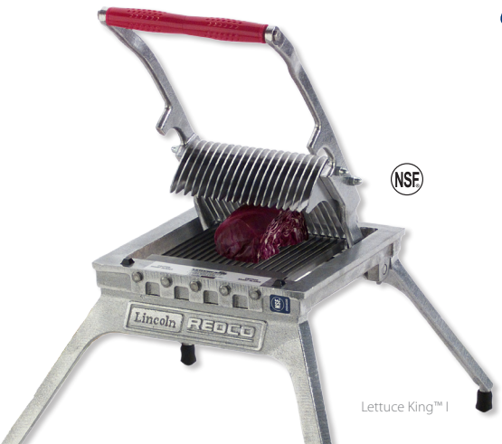
Lettuce King™ I