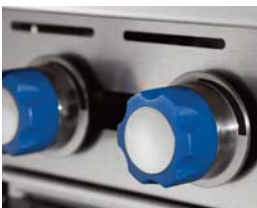
Durable cast aluminum with a vylox heat protection grip.