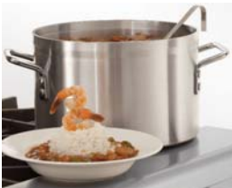
Large 5" (127 mm) stainless steel landing ledge for convenient plating.