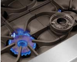
Two rings of flame for even cooking no matter the pan size.