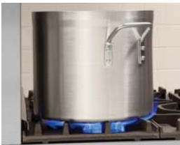
Back grate hot air dam deflects heat onto the stock pot, not the backsplash.