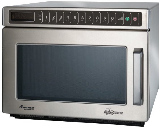
Model HDC212 shown