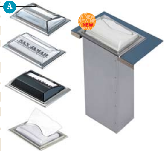
Counter Hole Dimensions