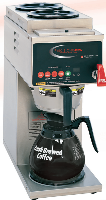
Model B-3 (Decanters sold separately)