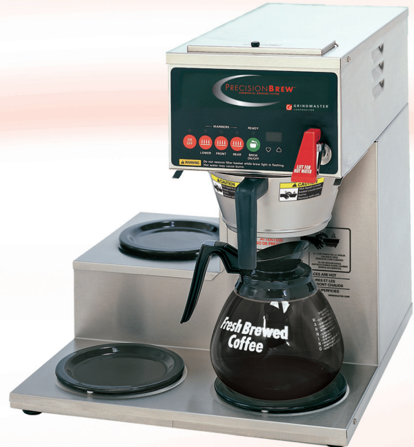
Model B-3WL (Also available with right side warmers: B-3WR) (Decanters sold separately)