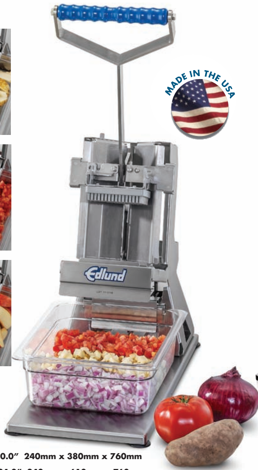
Table Dimensions: 9.5" x 24.0" x 24.0" 240mm x 610mm x 760mm

Wall Dimensions: 9.5" x 15.0" x 30.0" 240mm x 380mm x 760mm