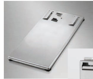
Suction Cup Table Base