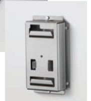
Quick disconnect wall mount bracket