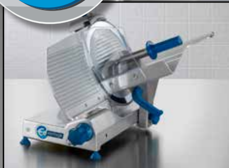
EDV-12C 12" Compact