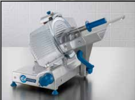
EDV-10C 10" Compact