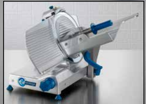
EDV-12 12" Medium Duty