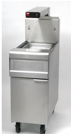
15MC Spreader Cabinet with optional Food Warmer, holding station with cafeteria pan and casters. .

Food warmer and holding station with scoop-type pan.