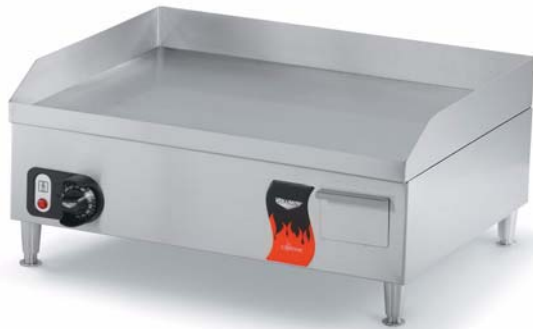
Cayenne® Electric Griddle - Model 40716