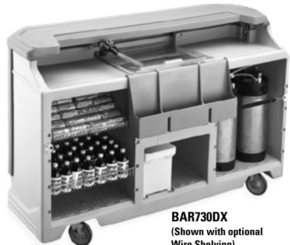
BAR730DX (Shown with optional Wire Shelving)