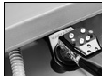
Premium quality 6-button, pre-mix soda gun by Wunder-Bar®.