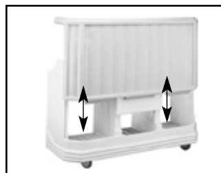
Detachable front for easy access to inventory and routing lines, tubes and hoses.