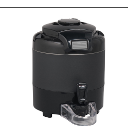
TF SERVER, DSG2 1G BLK NOBASE