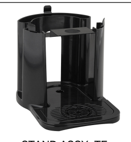
STAND ASSY, TF SERVER