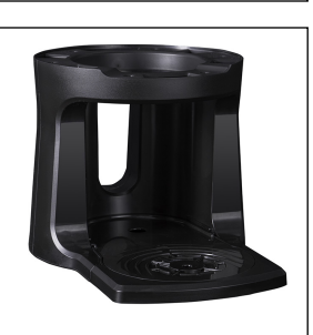
STAND ASSY KIT, TF SERVER