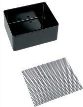
DRIP TRAY KIT (2.5\"/>