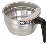
FUNNEL ASSY,SST-BLK HDL(7.62