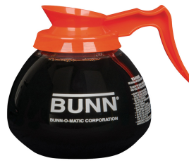
DECANTER, GLASS-ORN 12 CUP 1PK