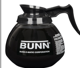
DECANTER,GLASS-BLK 12C 24/CS