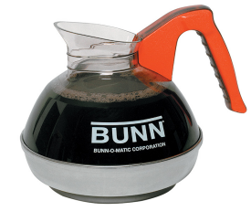
EASY POUR,(ORN) 6/CS