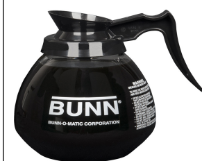
DECANTER,GLASS-BLK 12CUP 1PK