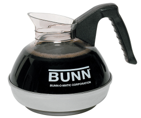
EASY POUR,(BLK) 6-1/2 CS