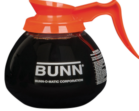
DECANTER, GLASS-ORN 12C 24/CS