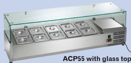
ACP55 with glass top